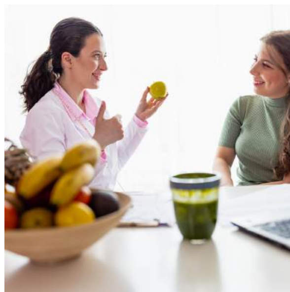
Personality assessment with consultation