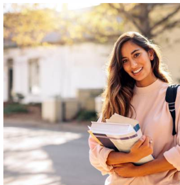
Virtual coaching sessions