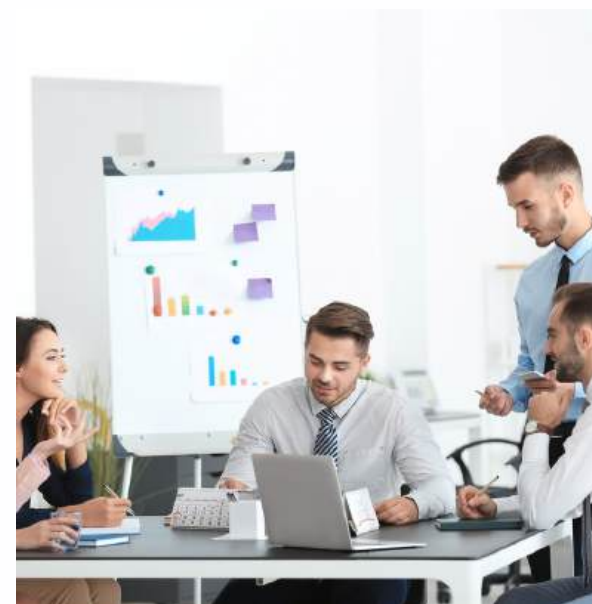
Online Workshops and Seminars